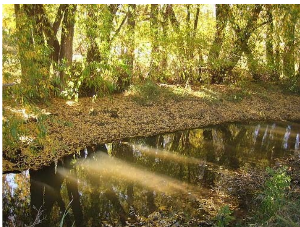
Rolland Moore Park

3rd Wednesday of every month- Meetings are held at the Pathways Hospice at 305 Carpenter Road in Fort Collins.