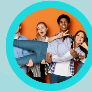
Youth & Young Adults