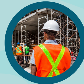
High Risk Industries