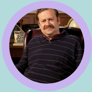
Men in the Middle Years